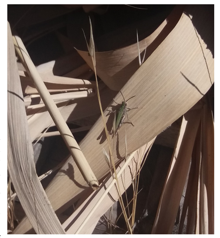
Fig. 2. Male field grasshopper, Chorthippus brunneus , on fourth-floor reed bundle, observed stridulating.