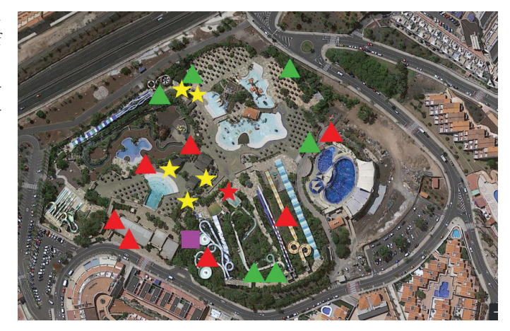
Fig. 3. Map of Sphodromantis viridis observations in the Aqualand Costa Adeje water park; red triangles: damaged or hatched oothecae, green triangles: unhatched oothecae, yellow stars: unsexed nymphs, red star: sub-adult male, purple square: adult female.

In recent years, there has been a rapid change in the spread of praying mantids around the world, with many native species expanding north due to higher global temperatures and many alien species introduced by humans in numerous territories, following the main trade routes such as the one that starts from Asia to get to Europe (Shcherbakov and Govorov 2020). Most alien mantids are members of the Mantidae family: extremely adaptable generalist predators of considerable size and capable of proliferating even in environments profoundly modified by human activities. Sphodromantis viridis also has these characteristics, with the difference that this mantiss more linked to xerothermophilic contexts and seems to expand in a more restricted way than other genera of mantis with which it is related, favoring places with a climate and environment similar to those of the species' origin. The beginning of the expansion of this mantis in the territories that are currently part of its distribution range probably occurred in the Pleistocene (La Greca 1966) during the end of the glaciation and warming of North Africa and the Euro-Mediterranean area. The subsequent isolation of some populations in different areas of Africa has allowed these mantids to fragment into different subspecies, each characterized by specific morphological and morphometric characteristics (La Greca and Lombardo 1987). The number and validity of the subspecies of S. viridis have always been the subject