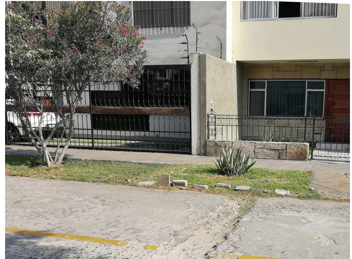
Fig. 1. Habitat of Myrmecophilus (Myrmecophilus) quadrispinus ; Peru, Lima, November 2020.

The finding of M. (M.) quadrispinus represents the first record for Peru and all South America. M. (M.) quadrispinus was previously known from the tropics and subtropics of southeast Asia and the Indian Ocean (Hsu et al. 2020). The ant crickets are difficult to find because of their cryptic mode of living in the ant nests. Therefore, we can assume that M. (M.) quadrispinus or other Myrmecophilus species can be found in other regions of Peru and South America in the future.