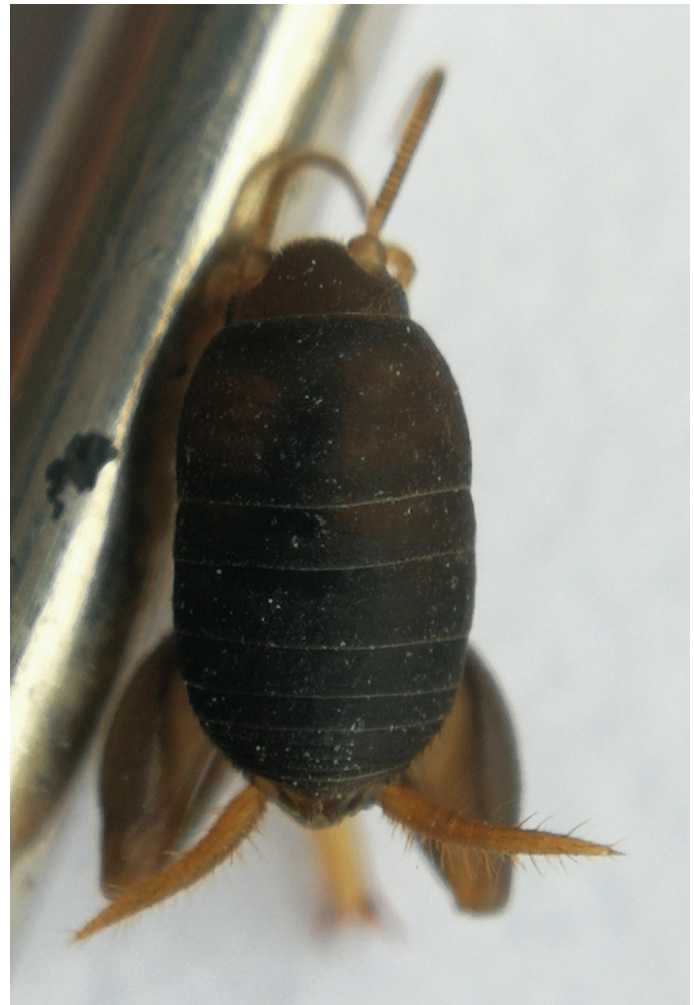
Fig. 2. Myrmecophilus (Myrmecophilus) quadrispinus , female; Peru, Lima, July 2020. Habitus, showing the typical shape and uniform brown body color of the species.