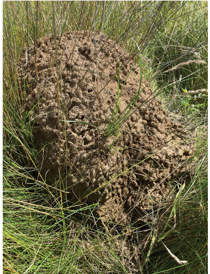
Fig. 3. Ant hill ( Lasius spp.) in rewilded grassland at Black Bourn Valley, probably used for egg-laying and basking by grasshoppers.

As succession progresses on rewilded sites, the prevalence of ant hills should be monitored to ensure that this valuable resource for invertebrates persists. If there is a loss of bare earth on ant hills