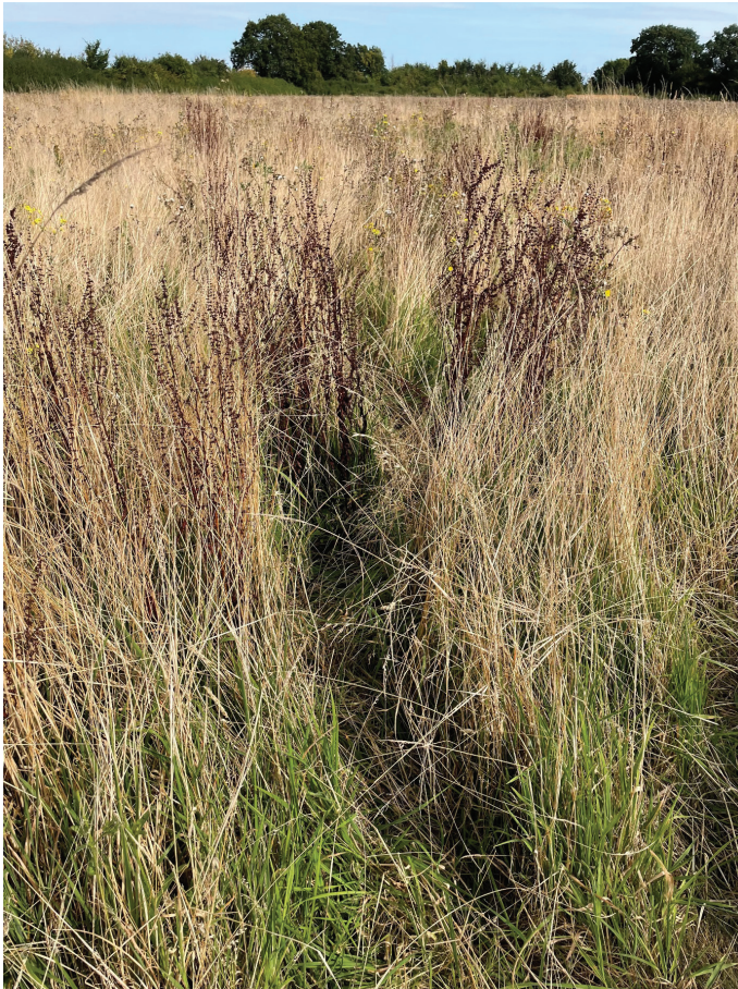
Fig. 6. Deer paths through tall grassland, creating localized variation in sward structure in older fields.

Soil fertility. —On soils with high fertility (e.g., clay) farmed intensively for years, a low diversity, tussocky sward less favorable to Orthoptera may develop (Gardiner 2006, 2009). Natural regeneration on highly fertile arable soils often produces grassy swards of low diversity with minimal benefits to Orthoptera due to unfavorable tall sward height and lack of structural diversity (Gardiner 2009) or to butterflies that are restricted because of the dearth of nectar sources (Field et al. 2005, 2006, 2007). Therefore, farmland suitable for the maximal rewilding benefits must be carefully chosen. Farmers could remove fields from arable production and rewild them on the infertile or difficult-to-crop parts of their farms, perhaps rewilding 10–15% of total crop area. Rewilding Max may be the preferred option in these circumstances for Orthoptera, in that active conservation grazing is probably unnecessary where wild grazers such as lagomorphs can have a significant beneficial impact for invertebrates.