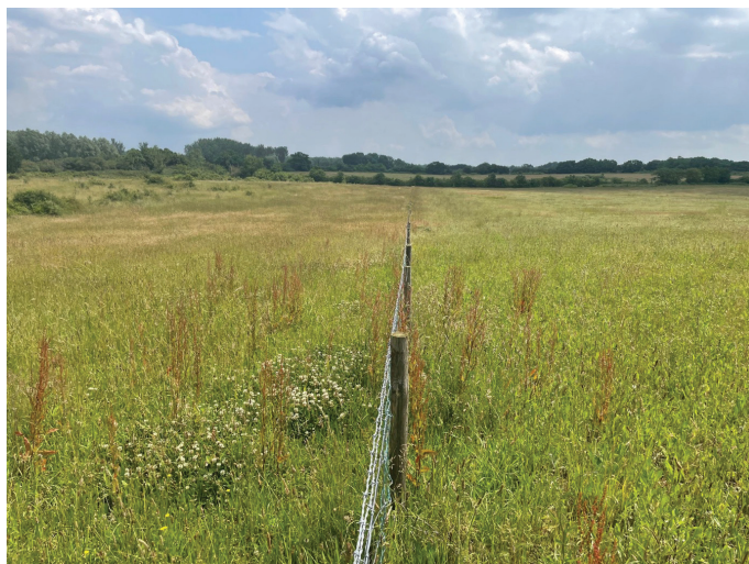
Fig. 4. Rewilded grassland at 4 years (right) and \geq 8 years (left) since cropping cessation. Note the greener vegetation of the soft brome Bromus hordeaceus -dominated field (right) compared to the red and brown hues of the creeping bent Agrostis stolonifera and red fescue Festuca rubra of the older fields.

Deer droppings and laydown areas were not significantly different between field types in the current study, indicating that ungulate grazing was evenly distributed across Black Bourn Valley (Fig. 5). There was weak evidence of greater deer path frequency in older fields (Fig. 6), indicating that ungulate passage may have had localized benefits for grasshoppers that need heterogeneity in sward structure. However, the shorter grass of deer paths was not numerous enough to make a difference to either mean sward height or structural range (Table 4), despite the micro-habitat mosaic and structural diversity that has been observed in other studies (Adler and Proud 2021). Deer may control the regrowth of scrub in the long term to maintain the mosaic of sparse grassland and woody vegetation, while ants and lagomorphs create the necessary bare earth for disturbance-dependent invertebrates. Seed dispersal can also occur due to ingested seeds being deposited across fields in fecal matter from grazing deer and lagomorphs, which may lead to the establishment of A. stolonifera swards (Eycott et al. 2007). It is possible that A. stolonifera swards favorable for C. brunneus and P. parallelus have developed along this successional trajectory at Black Bourn Valley.