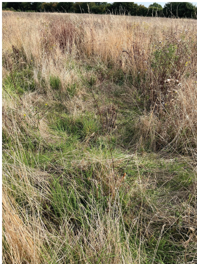
Fig. 5. Deer laydown areas with shorter vegetation (and droppings), creating localized variation in sward structure in both field types.

Corridor linkage. —The presence of an ancient green lane corridor with hedgerows and grass margins may have allowed O. viridulus to spread quickly into the rewilded fields (Fig. 7). The main population of O. viridulus appeared to be centered in two of the older fields where cropping ceased in 2013, from which individuals probably colonized the fields taken out of cropping in 2017. Both fields with high concentrations of O. viridulus are located next to a species-rich unimproved meadow and the Black Bourn River Valley, which may have been sources of colonizing grasshoppers and likely explains the fast colonization into rewilded fields (it was present in 7 out of the 8 fields). In the field nearest to Black Bourn River (Kiln Meadow; 100 m), 5 out of 8 of the remaining species were in highest abundance, further highlighting the benefits of connectivity between rewilded fields and corridors to aid quick colonization.