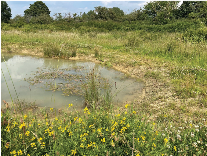
Fig. 2. Pond edge habitat with exposed soil in rewilded fields at Black Bourn Valley, valuable for groundhoppers ( Tetrix spp.) and field grasshopper Chorthippus brunneus .

The importance of restoring old ponds by vegetation clearance and creating new ones should be recognized in proposals for rewilding at new sites to benefit orthopterans that require bare earth edges clear of vegetation by lagomorph grazing (Fig. 2).