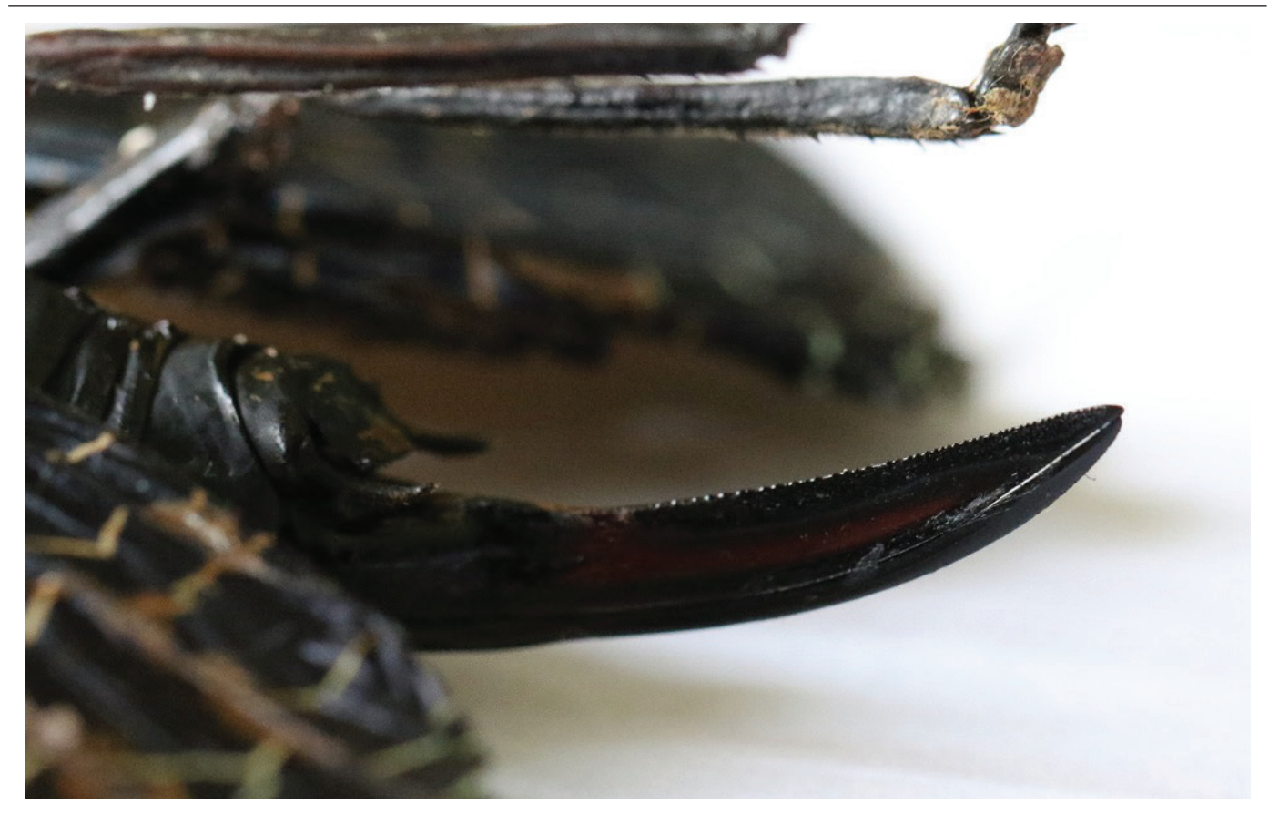
Fig. 5. Ovipositor of the female S. regalis showing its distinctly black base.