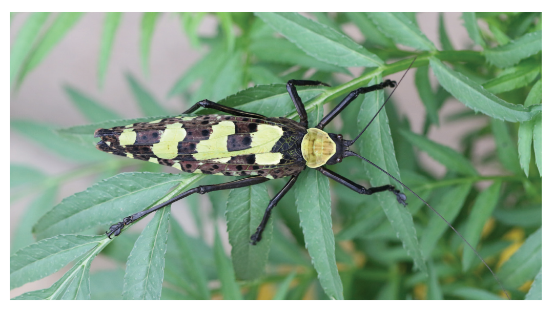
Fig. 1. Female individual of S. regalis from Tanahun. Photograph taken in Pokhara on 21 Sept. 2021 on a Tagetes L. plant.