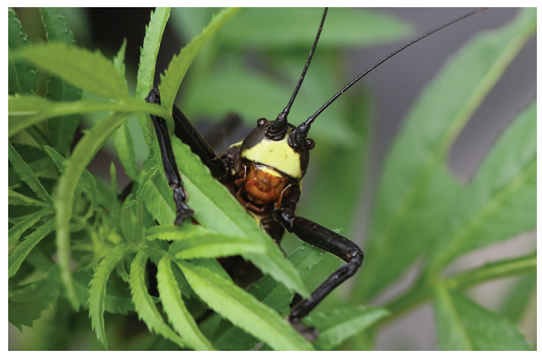
Fig. 2. Female individual of S. regalis from Tanahun showing the front and ventral sides of the head.