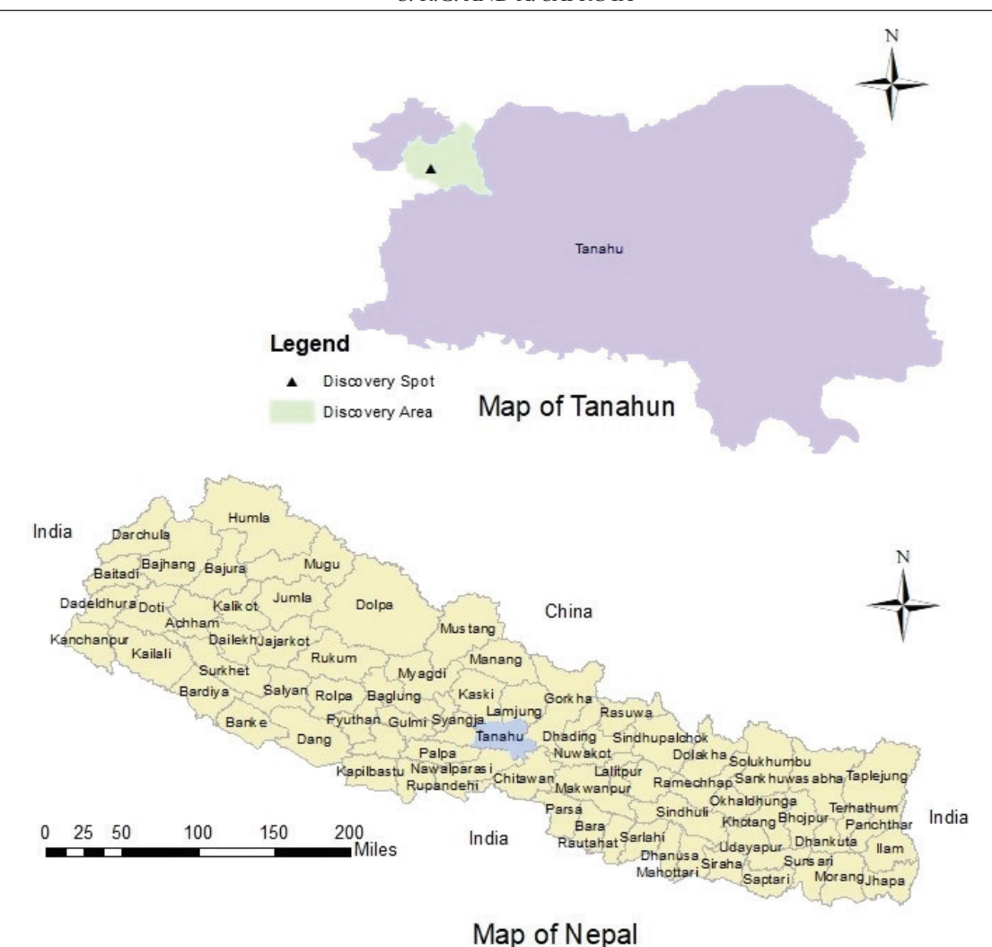
Fig. 7. Map of Nepal showing the discovery area.