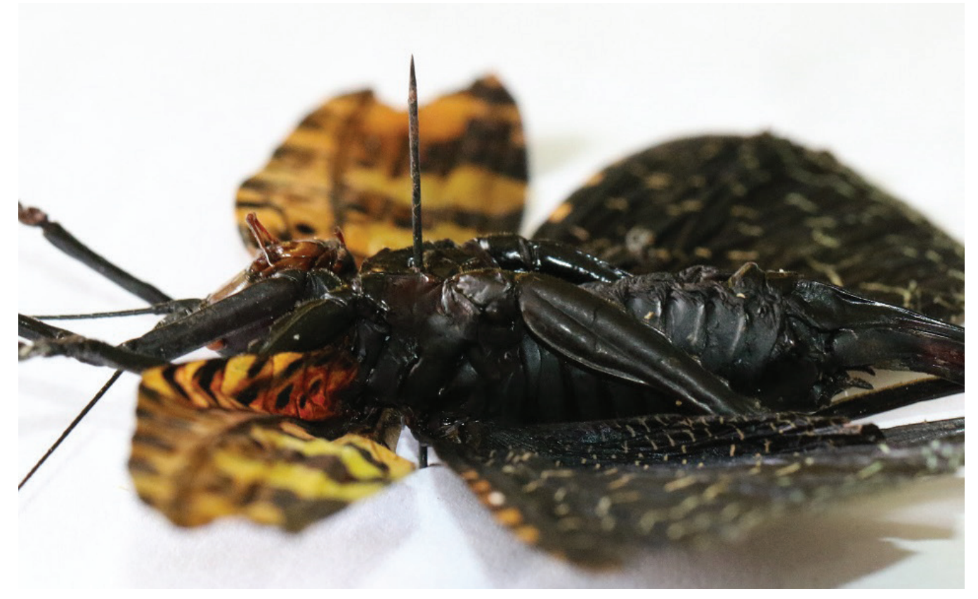
Fig. 6. Habitus (lateral).