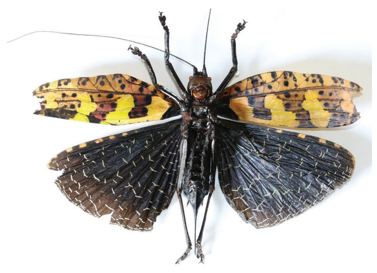
Fig. 4. Habitus (ventral).