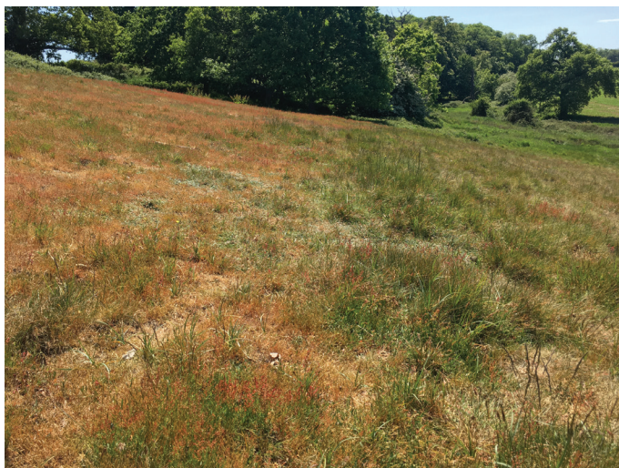
Fig. 2. South slope zonation from summit acid grassland with sheep's sorrel Rumex acetosella (left, red color sward) and abundant field grasshopper Chorthippus brunneus into lower, taller grassland (right) at Furze Hill.

Other pressure on Furze Hill included trampling by humans around the footpaths that cross the summit. During the 2020 Covid-19 lockdowns, there was noticeably higher trampling pressure (pre-Covid estimate <10 walkers/hour; during this study >20 walkers per hour) on the summit grasslands that formed part of the north and south high slopes in this study. Undoubtedly, this created bare earth in addition to lagomorph grazing and disturbed orthopterans. The significance of this is likely to be minimal compared to the population of rabbits on the hill, and it is unlikely