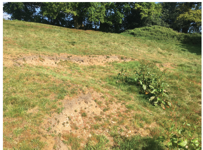
Fig. 3. Bare earth and short vegetation in a slope slippage 'amphitheater' utilized by grasshopper nymphs, field grasshopper Chorthippus brunneus adults, and slender groundhopper Tetrix subulata on a rabbit-grazed hilltop at Furze Hill.