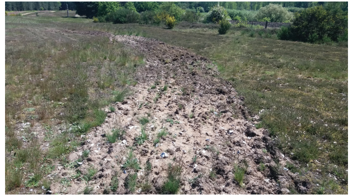
Fig. 1. Disc-harrowed strips in May 2018, three months after disc harrowing, showing partial revegetation and variation in exposed substrate.

Each transect was walked at a slow, strolling pace (2 km/hr) from May–July of 2018 and 2019 (5 surveys in each year, 10 in total). Nymphs flushed from a 1-m wide band in front of the observer were recorded along the center of the 2.5 m harrowed strip and in the control. As it is difficult to distinguish between species in the early instars, nymphs of both species were lumped together for recording purposes. The surveys were undertaken in vegetation sufficiently short (<50 cm) to minimize the possibility of overlooking nymphs in tall grass (Gardiner et al. 2005). With practice, it was relatively easy to ascertain the species of adults without capture (Gardiner and Hill 2006). In addition to nymphs and adults of the two grasshopper species, other orthopteran species were counted on transects to provide an estimate of assemblage abundance and species richness. The weather conditions on survey days were favorable for insect activity, being largely sunny and warm (>17°C).