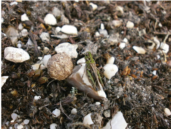
Fig. 3. Typical Myrmeleotettix maculatus habitat: stony, exposed soil with little vegetation.

10–20 cm in height (Gardiner et al. 2002), suggesting that the harrowed strips lacked the required patches of tall grass for shelter and feeding (Bernays and Chapman 1970a,b), despite an abundance of oviposition habitat. Consequently, without taller refuges from the often excessive microclimatic temperatures of bare soil, larger species ( C. brunneus at 15–25 mm as compared to M. maculatus at 12–19 mm; Marshall and Haes 1988) may disperse to unmanaged vegetation to seek shade (Gardiner and Hassall 2009).