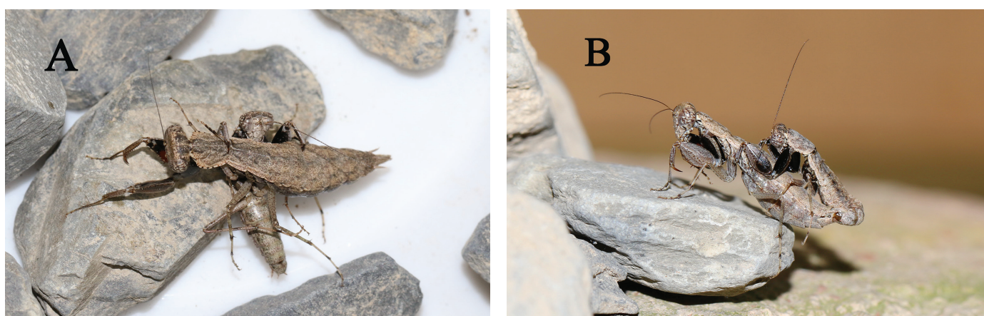
Fig. 4. Copulation behavior in Holaptilton brevipugilis . A. Male mounting failure. Male is underneath the female. B. Copulation. Smaller male is on top of the larger female.

Sixteen of the 28 trials led to copulations that occurred 5–28 seconds after mounting. One trial in which the male mounted in a reverse position delayed this pre-copulation period for more than four minutes. I terminated two trials after males mounted for 20–24 minutes but did not successfully contact the female's genitalia. Body measurement confirmed those two males (with 1.05 and 1.07 cm body length) were among the smallest males, while those two females (with 1.77 and 1.86 cm body length) were larger than the average female (1.6 cm body length).