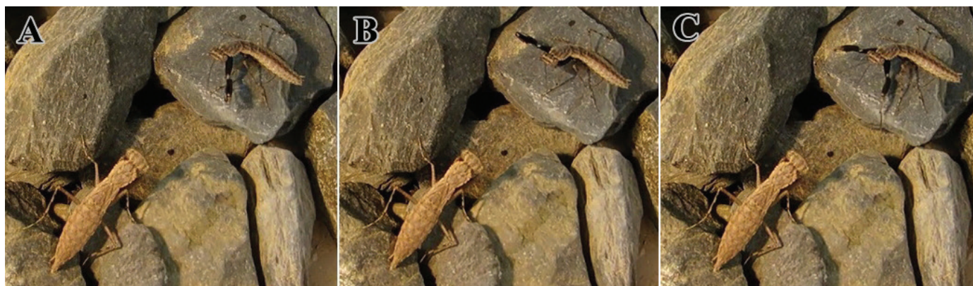
Fig. 3. Trembling and showing the shiny colored surface of forefemora by a Holaptilton brevipugilis male during a frontal encounter with a female.