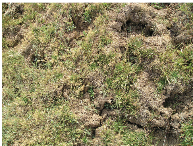
Fig. 1. Cattle trampled ground with an abundance of bare earth, credit T. Gardiner.

Vegetation structure is an important factor for grassland fauna (Duffey et al. 1974, Morris 2000), particularly for grasshoppers. Clarke (1948) and Gardiner and Hassall (2009) noted that vegetation height and density are the most important habitat factors for grasshoppers, particularly in respect to their influence on microclimate.