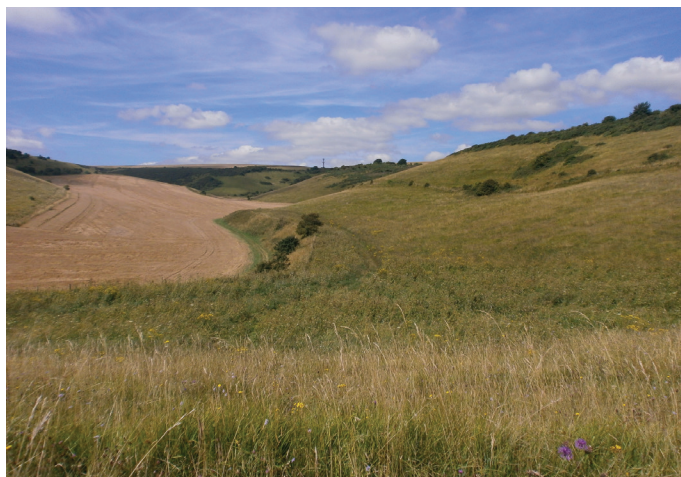
Fig. 3. Grazed chalk downland in Sussex, UK, habitat for the rare Decticus verrucivorus , credit T. Gardiner.