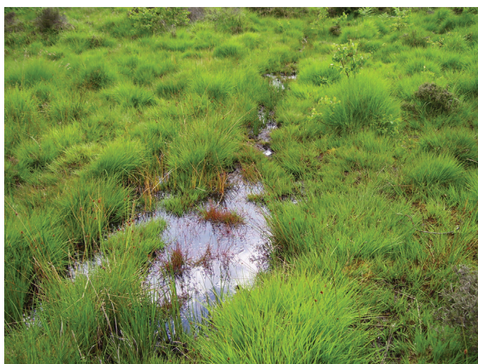
Fig. 4. Cattle grazed wet grassland in Epping Forest, UK, habitat for Omocestus viridulus , credit T. Gardiner.

in the 20 th century, although cattle grazing was reintroduced in 2002 and has since been linked to an increase in abundance of O. viridulus (Gardiner 2010; Fig. 4).