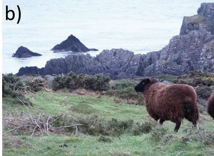
Fig. 3. The impact of targeted grazing in January 2017 after clearance of gorse two years earlier, A. vegetation either side of fencing; B. hardy Welsh Mountain-Texel cross sheep grazing on-site.

at levels insufficient to maintain habitat suitable for S. stigmaticus . A new Management Agreement is being negotiated with the landowner, who wishes to introduce Highland cattle.