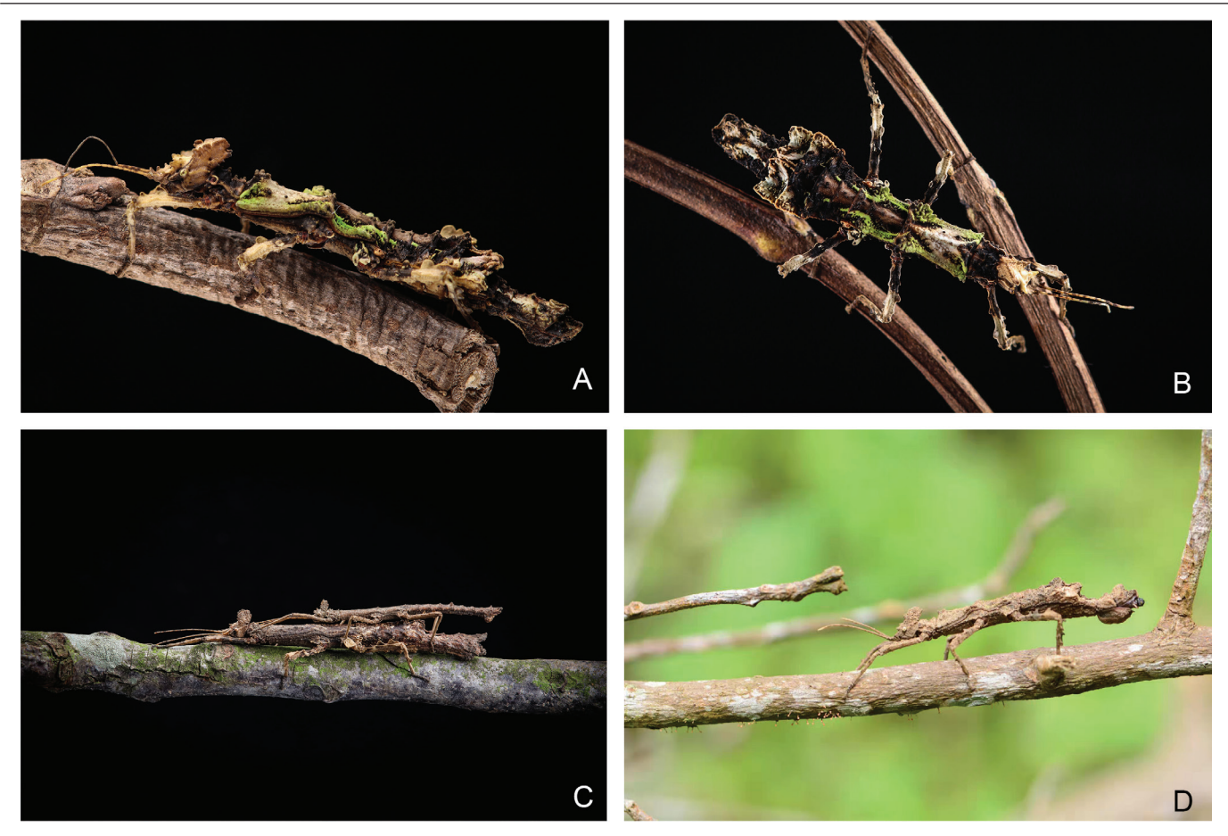
Fig. 3. Living photos. A, B. Pylaemenes gulinqingensis sp. nov. (Gulinqing, Yunnan, China); C. Hainanphasma cristata Ho, 2013 (Mt. jianfengling, Hainan Island, China); D. P. pui Ho, 2013 (Mengla, Yunnan, China).

in the middle area, and the number of specimens is small. If our hypothesis is true, high-altitude and low-altitude species may show different diversity (both morphologically and molecularly). The Chinese fauna of the subfamily Dataminae currently includes 10 specie, with the description of the new species. However, the species diversity of this subfamily in China is probably higher. Most of the species of this subfamily come from relatively low altitude in southern China. Therefore, in the relatively high-altitude mountains of southern China, there may be interesting species waiting to be discovered. Bank et al. (2021) analyzed the geographical locations of the subfamily Dataminae, including the Wallacea, Borneo, and mainland Asia. Therefore, in places such as Laos, Cambodia, Myanmar, and other places where species are still poorly known, we believe that more species will be discovered.