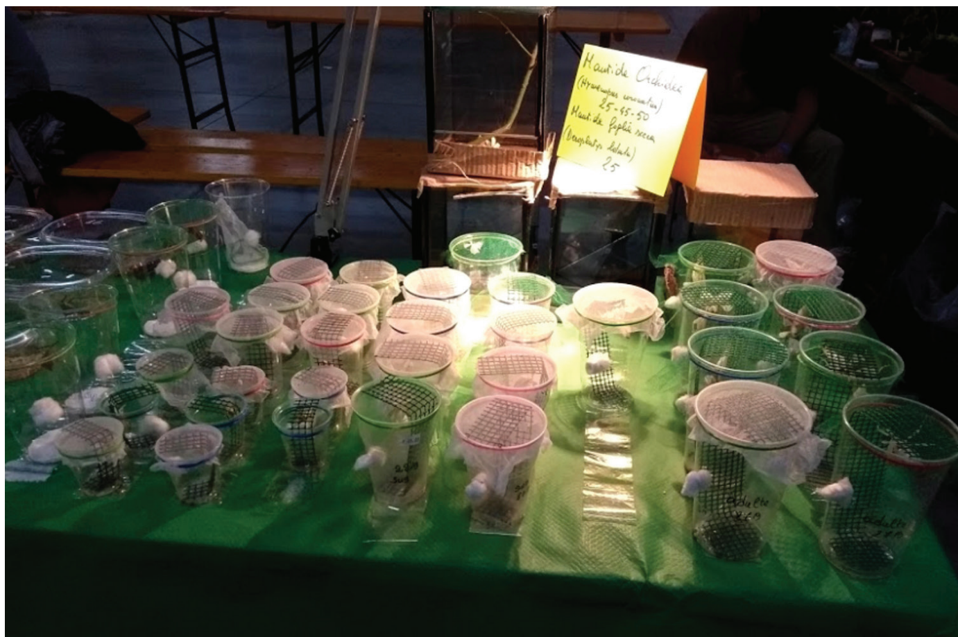
Fig. 1. Mantises sold in an exotic animal market fair in Italy.

Species ( Perlamantis alliberti Guerin-Meneville, 1843, in Battiston 2020; Empusa pennicornis Pallas, 1773 in Shcherbakov and Battiston 2020a; and Iris polystictica Fischer-Waldheim, 1846 in Shcherbakov and Battiston 2020b). In the recently compiled IUCN red list assessments of the Mantodea of Europe, 12 of the 37 species listed and assessed at a global level are classified as of least concern, 9 as threatened or extinct, and 16 as data deficient (IUCN Red List of Threatened Species – Mantodea). Europe is neither the richest region for mantis diversity nor the most representative for these insects, but it is probably the most entomologically well-known and studied area. Even with this long tradition of scientific research, the knowledge and conservation of these insects is still poor.