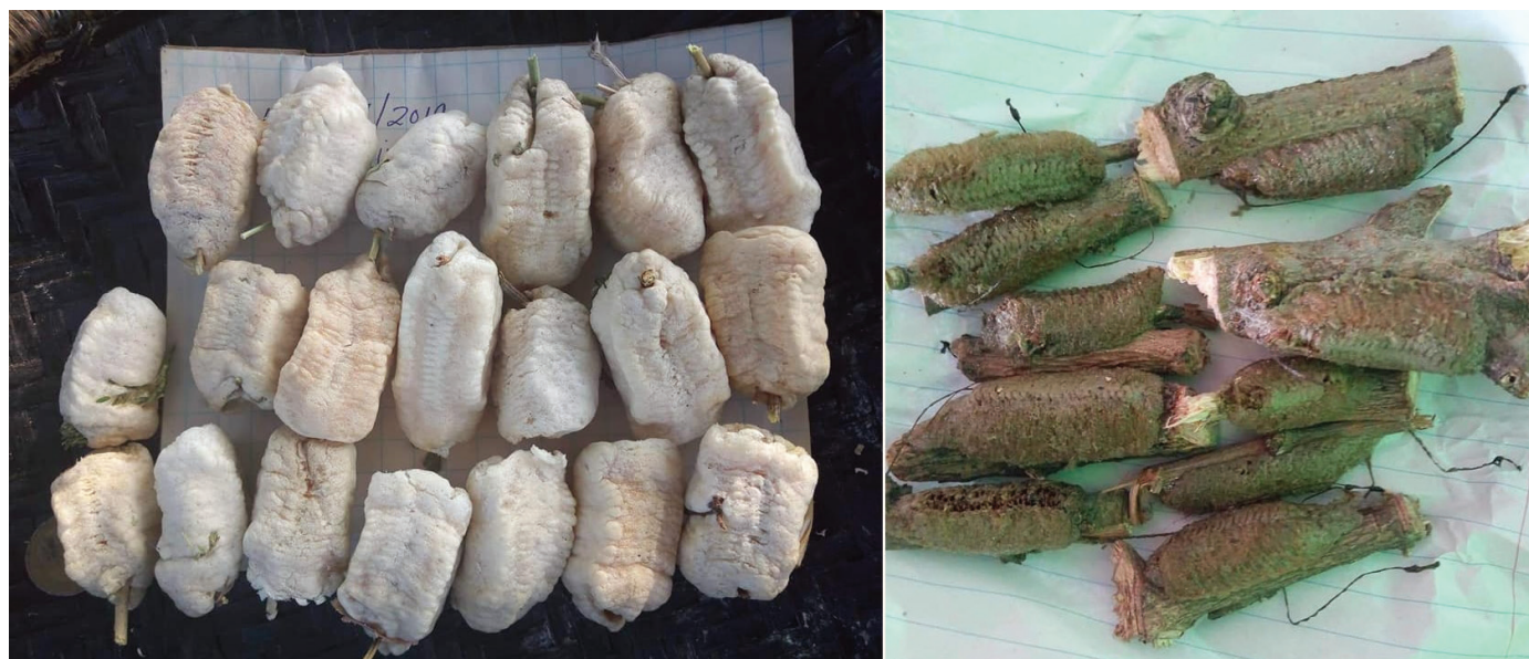
Fig. 4. Stocks of oothecae sold through social media (Facebook groups related to mantis enthusiasts). Idolomantis diabolica (Saussure, 1869) from Tanzania (left) and Stagmomantis carolina (sold as Tenodera ) from the United States (right).

On the other hand, this market is nearly the only source of information on insects whose biology and ecology are still poorly known and that are difficult to study. This point is reinforced by the status of previously assessed mantis species in the IUCN Red List of Threatened Species, where most mantis species are listed as Data Deficient. Of course, knowledge alone is not enough to save these species from extinction, but it is a valuable foundation. The lack of data on mantises hampers implementation of effective conservation measures (Hochkirch et al. 2021). The community around the mantis pet market is already large and active (Durrant 2003, Maxwell 2011), giving it the potential to be a strong ally in efforts to fill this gap. For this reason, efforts should be made to encourage this community to stay active and work with the scientific community. The value of such collaboration is exemplified by the countless number of scientific papers published using citizen-science data (e.g., Battiston et al. 2021, Moulin 2020) or observations on the biology of wild or