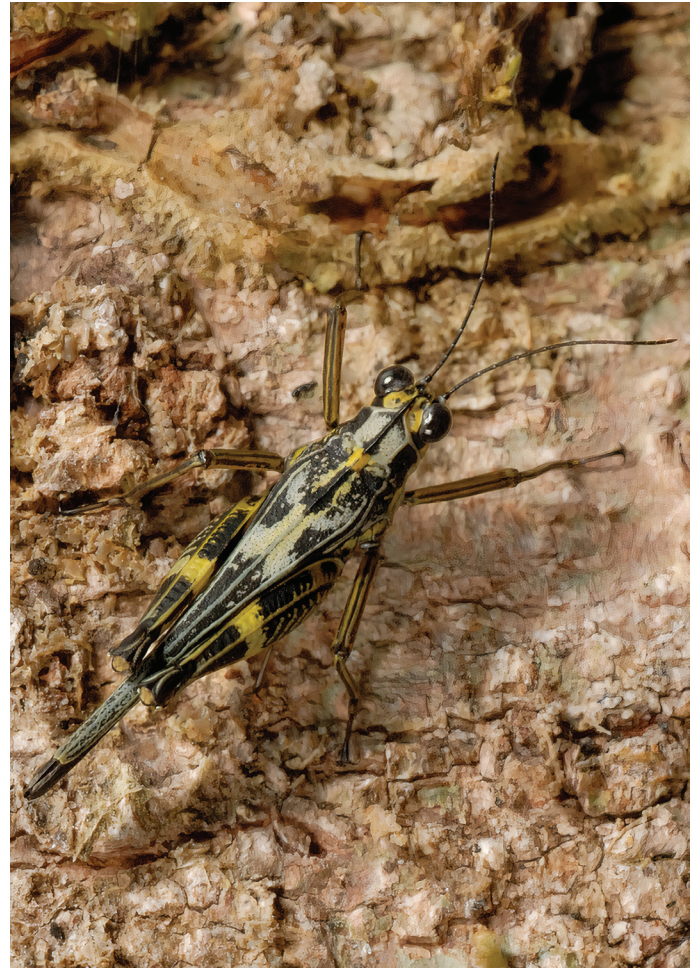
Fig. 6. Living male of Scaria sp. in dorsal view.

The nature of the name is an important point deserving to be separately discussed. Despite the existing rules of nomenclature provided by the ICZN, we did not manage to “legally” name this new species. The name is one of the first steps in investigating any species, learning about its behavior, habitat, and distribution. Article 72.5.6. of the ICZN states, “In the case of a nominal species-group taxon based on an illustration or description, or on a bibliographic reference to an illustration or description, the name-bearing type is the specimen or specimens illustrated or described (and not the