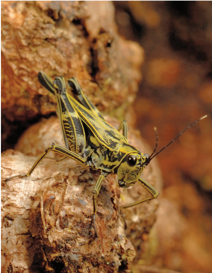
Fig. 5. Living female of Scaria sp. in frontolateral view.

Grant, 1956) (Grant 1956, Cadena-Castañeda et al. 2019, Silva et al. 2021). The lack of a lateral stripe on the pronotum of Scaria sp. might be caused by the fact that our species has a multicolored pronotum on which the stripe might simply be difficult to notice and distinguish. A similar case has been observed in a living specimen of S. hamata (De Geer, 1773) reported by Cadena-Castañeda et al. (2019: fig. 36). In the key given by Cadena-Castañeda et al. (2019), Scaria veruta can be distinguished from other species by tegmen with an ovoid subapical spot. However, the key then forwards a reader to the previously mentioned figure 17, a specimen of S. veruta with yellowish ventral line on the tegmina. Also, figure 34 shows a living specimen of S. veruta with tegminal sinus and tarsal pulvilli different from the ones on specimen from figure 17. This brings us to question whether all these specimens belong to the same species.