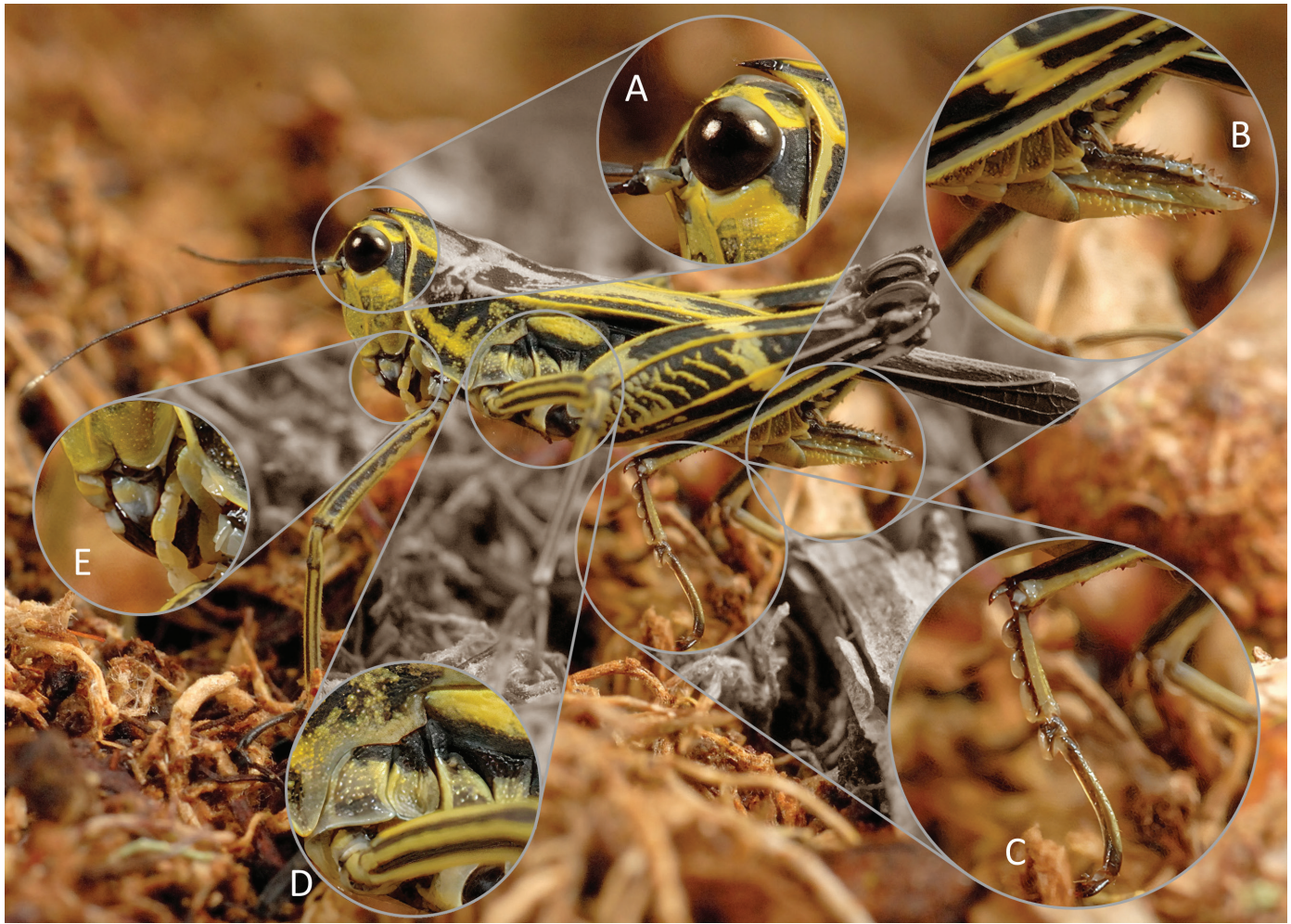
Fig. 2. Example of AI enhancement of Scaria sp. body details compared to original photography in the background. A. Upper part of the head, showing an eye, a scapus, and a pedicel; B. Ovipositor; C. Hind tarsus; D. Ventral and tegminal sinuses; E. Bottom part of the head, showing the mouthparts.

scapus. Pedipalps white. Transverse carinae concave. Fossulae deep and pronounced. Median carina absent. In dorsal view: Vertex the same width as compound eye (male) or 1.7 times as wide as compound eye (female). Eyes of a bulbous kidney shape. Frontal costa not straight after bifurcation (see Fig. 4A).