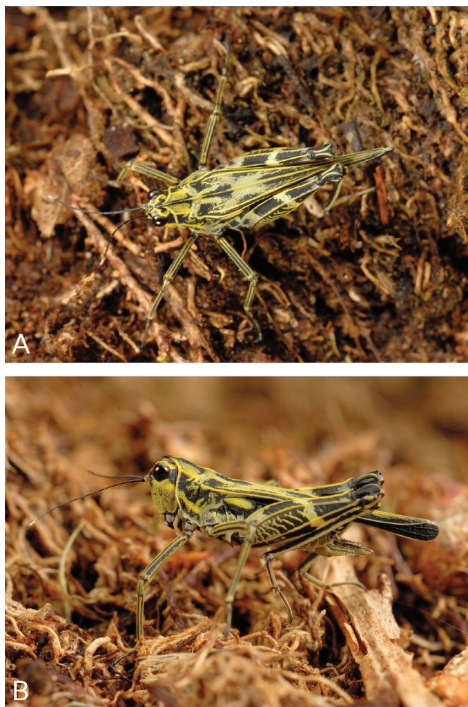
Fig. 4. Living female of Scaria sp. in A. Dorsal view; B. Lateral view.

Sexual dimorphism. —This unnamed species exhibits marked sexual dimorphism in general appearance of sexes, vertex width, pronotum stature, and coloration. Some of the observed differences could be due to the limited sample, i.e., we have examined photographs of only one male and one female, but we nonetheless decide to discuss them as they could prove to be useful in the future. Vertex: Ratio of vertex width and width of compound eye in dorsal view much higher in female (1.7) than in male (1). Pronotum: Ratio of width between prozonal carinas and the width between humeral angles are equal in both sexes. However, the ratio of the length of the pronotum and the widest width between the humeral angles is much less in the female (5.15) than in the male (5.7). Coloration: Observed pattern of coloration is almost identical in both sexes, with varying degrees of color saturation in certain areas. Legs in male appear more saturated than in female. Pronotum of female appears more saturated than that of male.